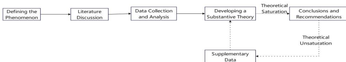
Figure 1 Specific Process of Grounded Analysis

By employing the three-stage coding process of grounded theory, this study ensures the gradual construction of a theoretically robust framework closely linked to actual data. This methodology emphasizes the inductive and iterative nature of the research process. It fosters close alignment and interaction between theory and data, enhancing the research findings' originality and depth. The specific process of grounded analysis is illustrated in Figure 1.